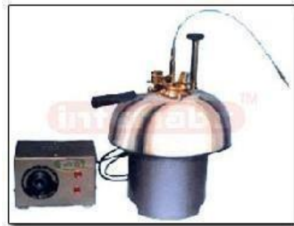
PENSKY MARTIN'S APPARATUS